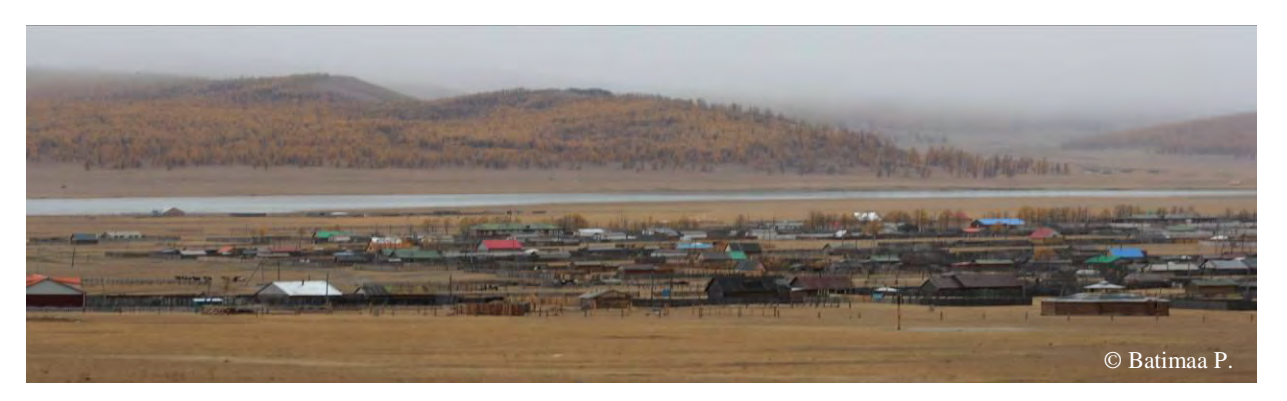
Figure 2. Khatgal Village

Khuvsgul lake is one of seventeen ancient lakes worldwide more than 2 million years old and the most pristine and is the most significant drinking water reserve of Mongolia. Its water is potable without any treatment. Khuvsgul is an ultraoligotrophic lake with low levels of nutrients and primary productivity and high water clarity. The Lake area is a National Park bigger than Yellowstone and strictly protected as a transition zone between Central Asian Steppe and Siberian Taiga. The town of Khamgal is at the southern end of the lake (Figure 2).